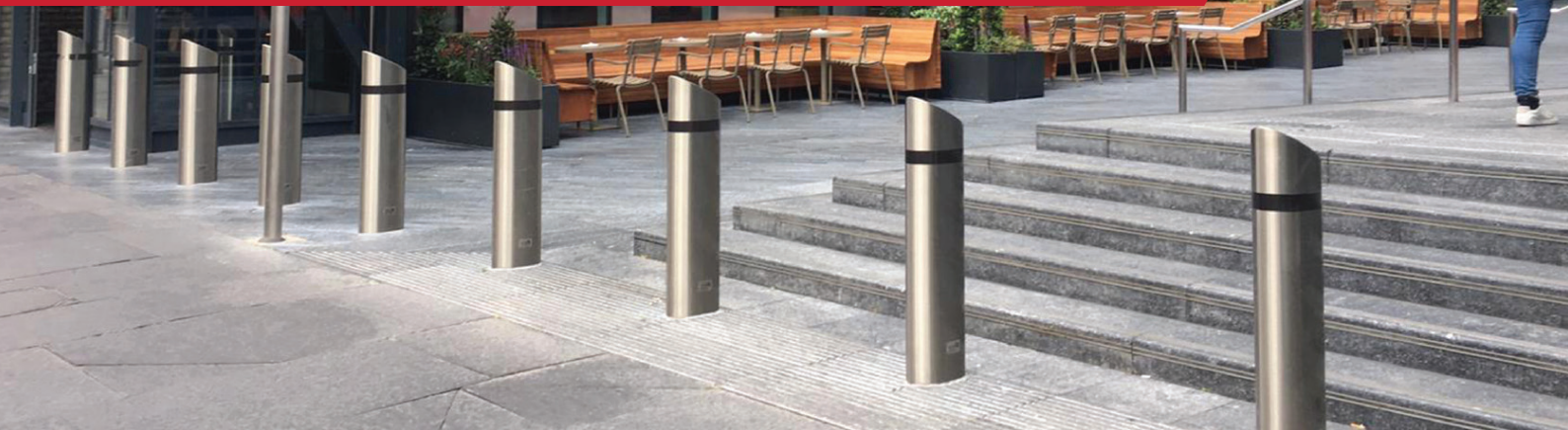
Spring Bollard Cover Side View

LOW COST SHALLOW MOUNT SINGLE FIXED/REMOVABLE BOLLARD