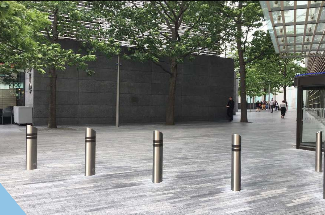
Spring bollard cover side view.