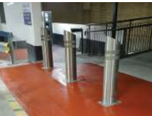
Spring Bollard Cover Side View

Safteyflex also offer a selection of shrouds and street furniture. Details available upon request.