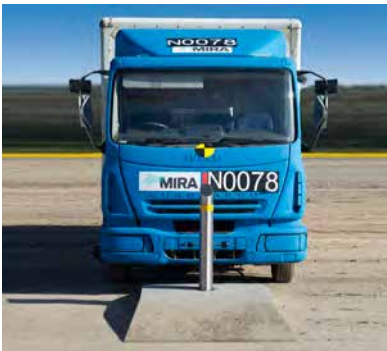
Safetyflex also offer a selection of shrouds and street furniture. Details available on request.