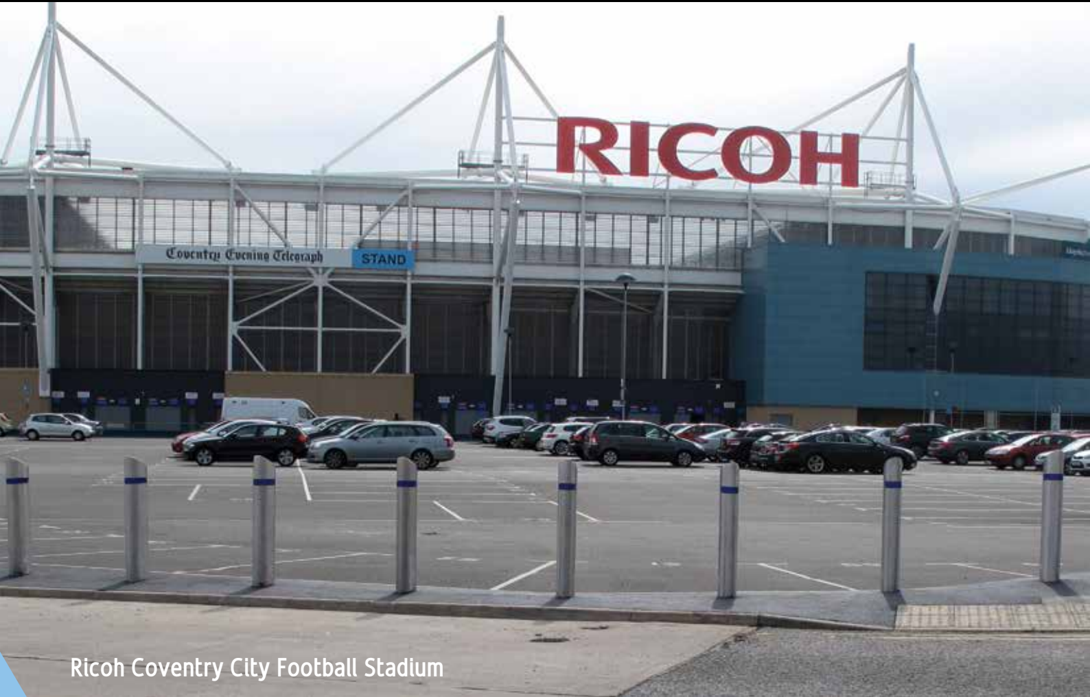
Ricoh Coventry City Football Stadium

Supplier of anti-terrorist bollards (Olympic venues) to the London 2012 Games