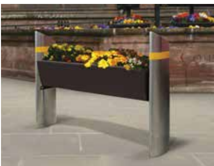
Safetyflex also offer a selection of shrouds and street furniture. Details available on request.

Supplier of anti-terrorist bollards (Olympic venues) to the London 2012 Games