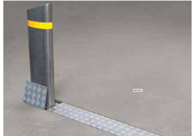
SLIMLINE MANUAL SINGLE RISING BOLLARD (400MM DEEP)